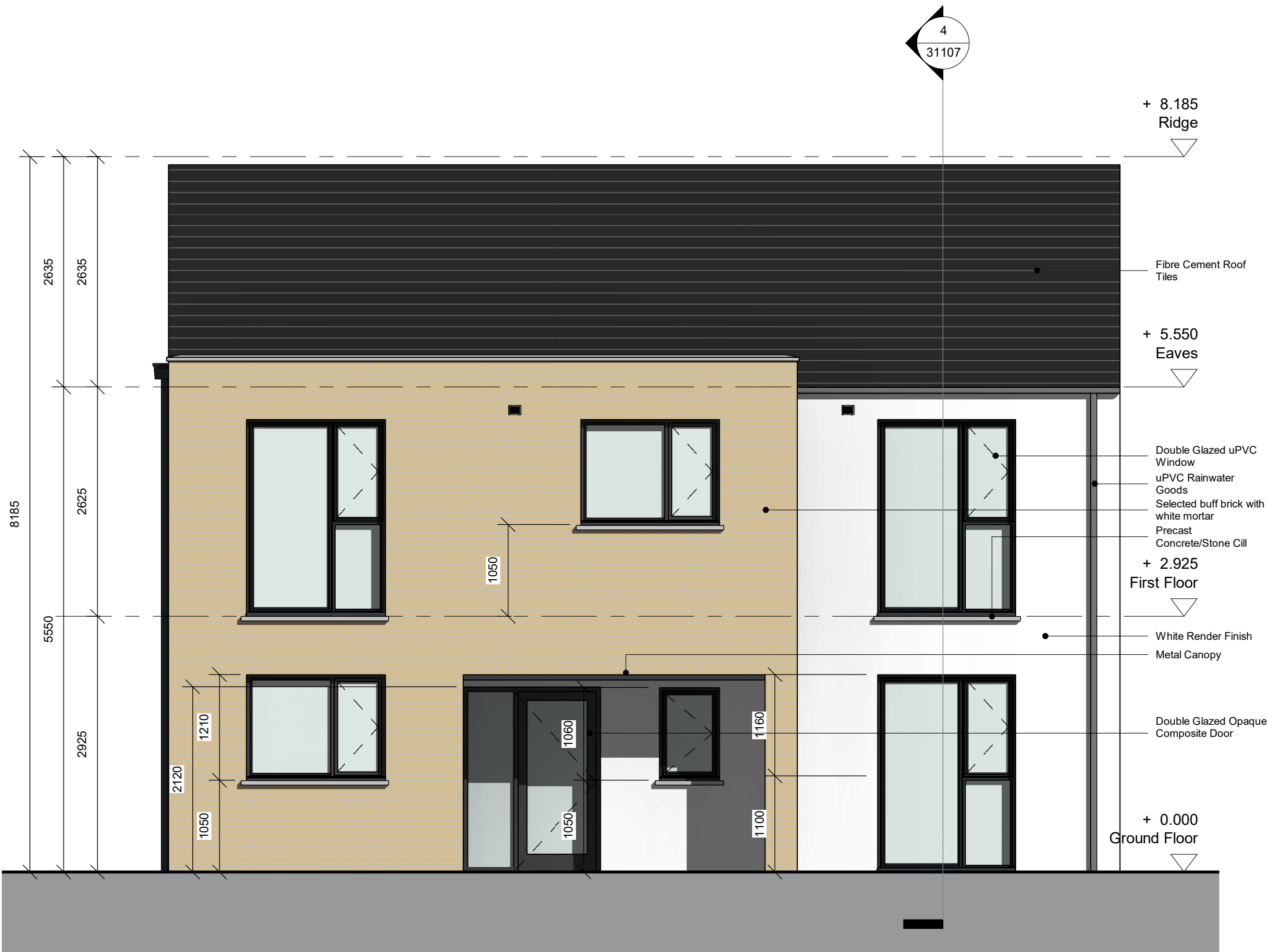
1 Front Elevation 1 : 50