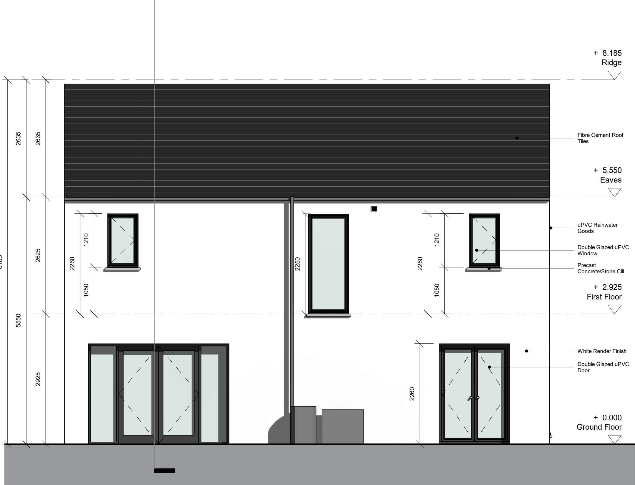
2 Rear Elevation 1 : 50