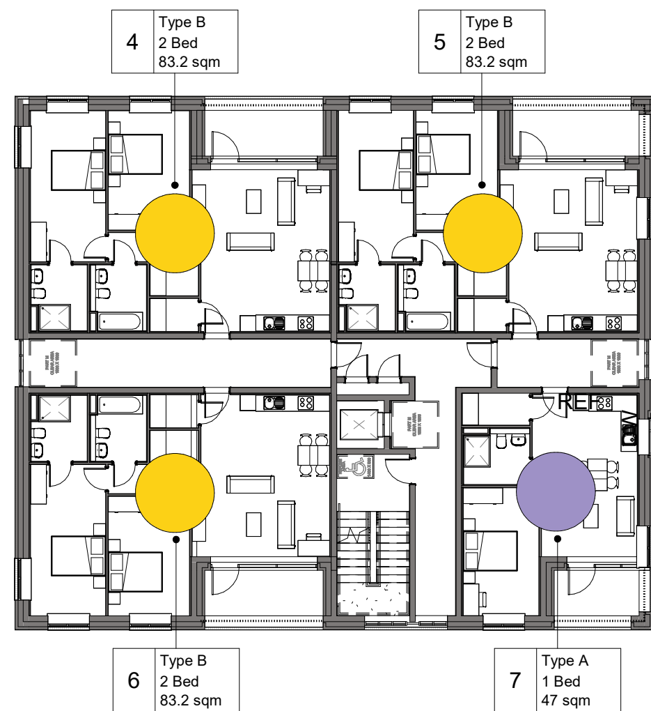
3 Apartment Block A First Floor - Age Friendly 1 : 200