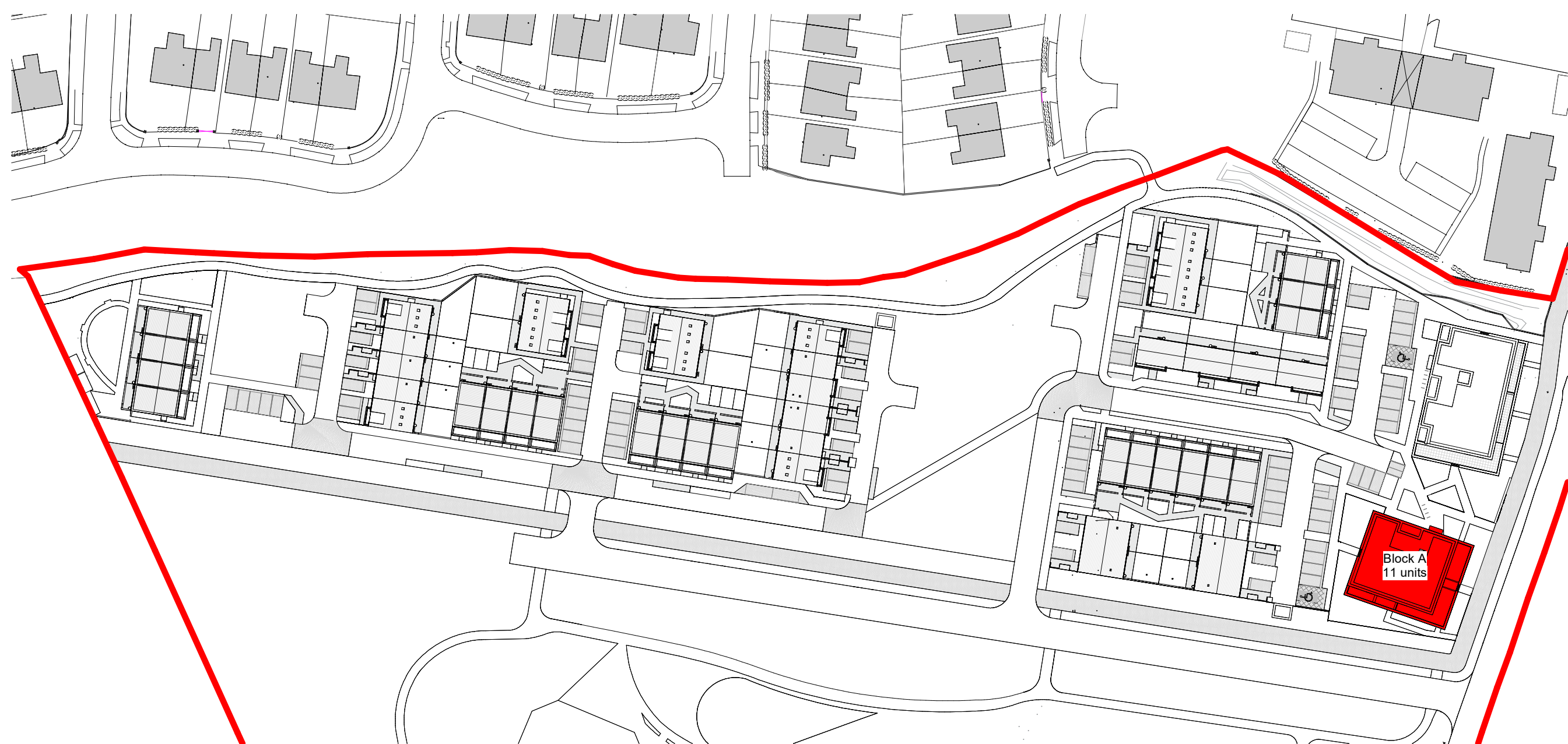
1 Age Friendly Housing Allocation 1 : 1000

Notes: DO NOT SCALE FROM THIS DRAWING. USE FIGURED DIMENSIONS IN ALL CASES. VERIFY DIMENSIONS ON SITE AND REPORT ANY DISCREPANCIES TO THE ARCHITECTS IMMEDIATELY. THIS DRAWING TO BE READ IN CONJUNCTION WITH THE ARCHITECTS SPECIFICATION. © THIS DRAWING IS COPYRIGHT AND MAY ONLY BE REPRODUCED WITH THE ARCHITECTS PERMISSION.