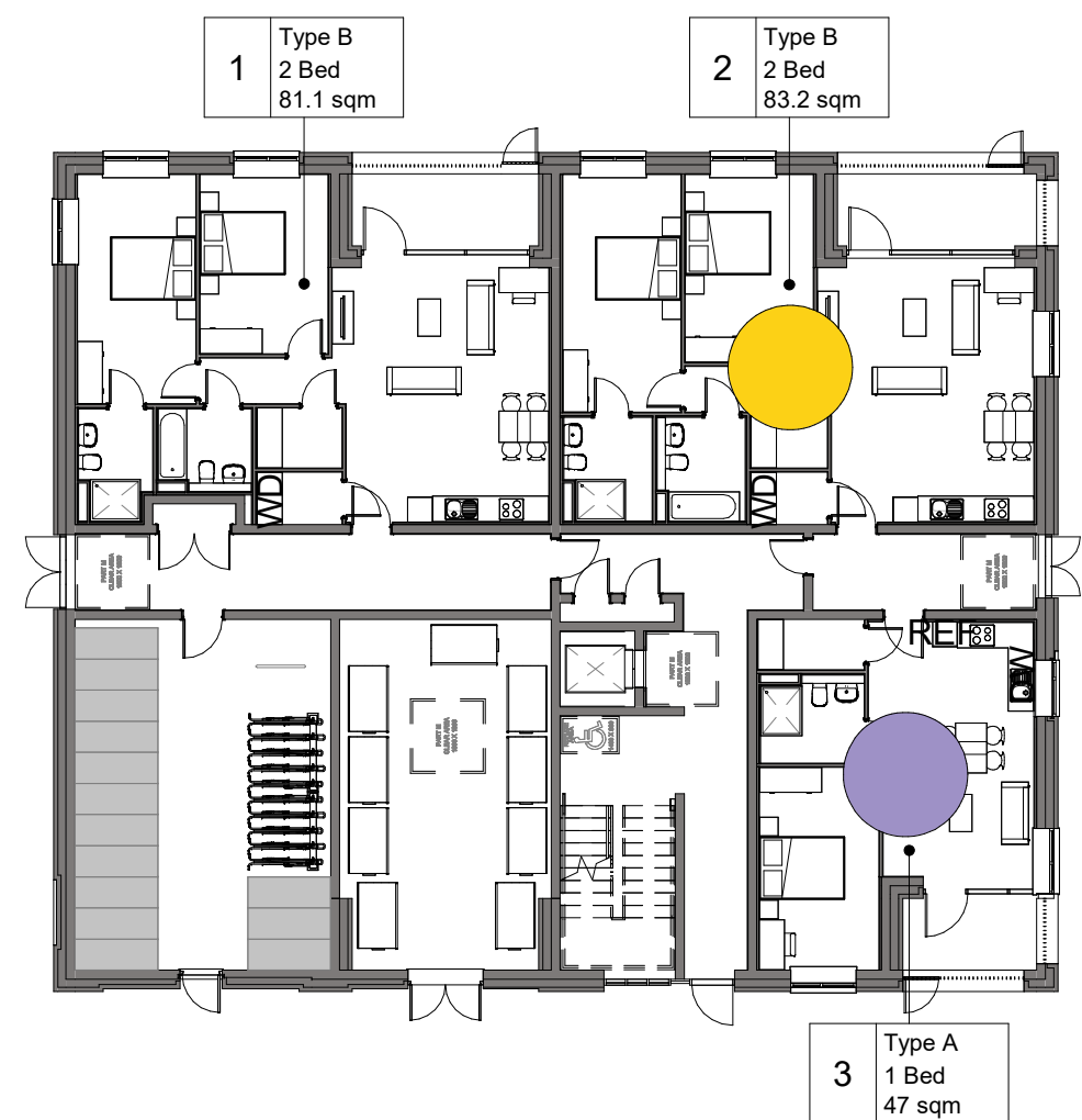
2 Apartment Block A Ground Floor - Age Friendly 1 : 200