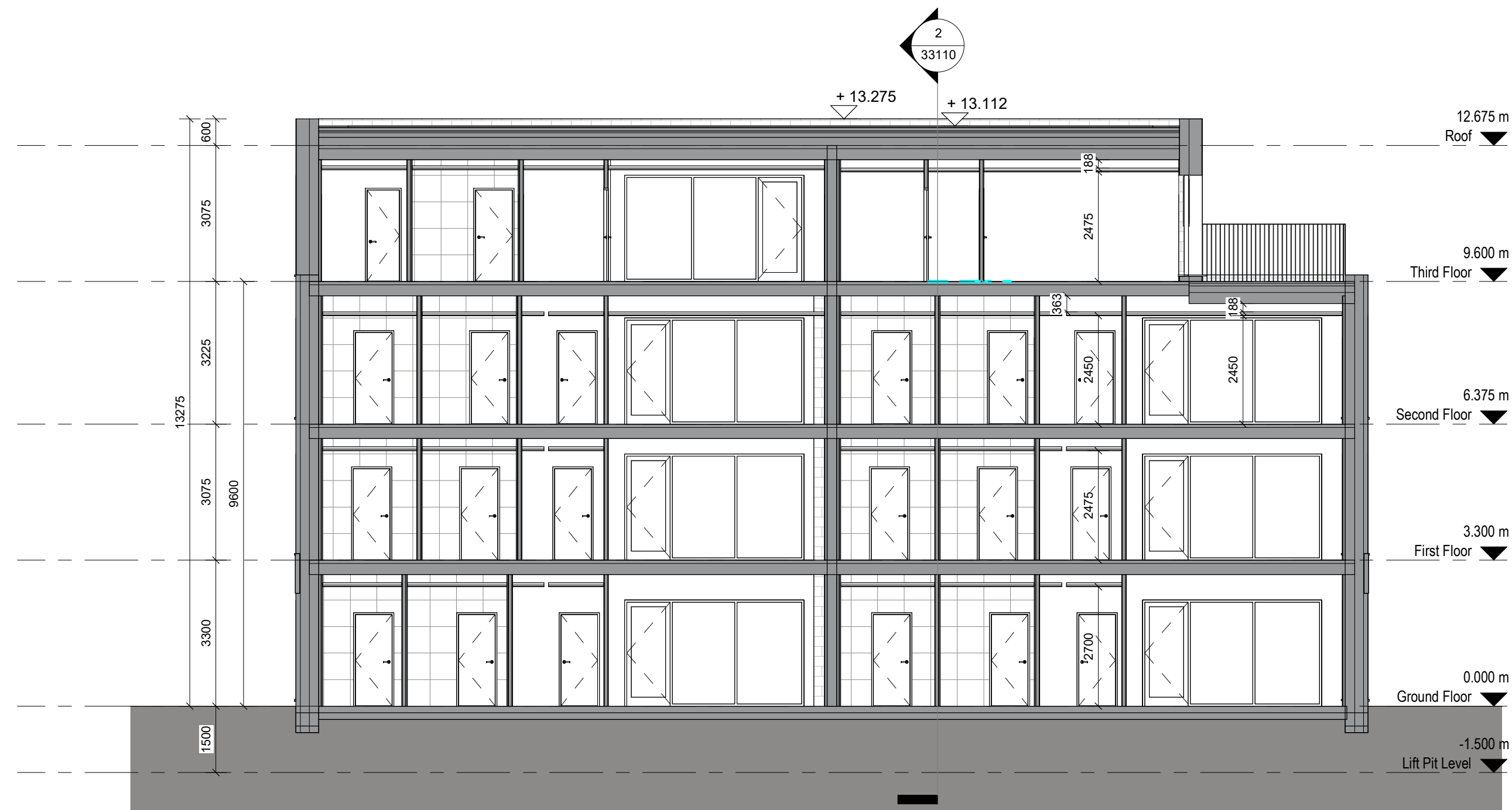
1 Apartment Block A Long Section